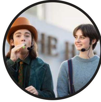
October 2023 James and the Giant Peach