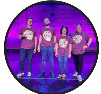
December 2023 Adult Comedy Lab Showcase