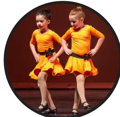
May 2024 Spring Reflection