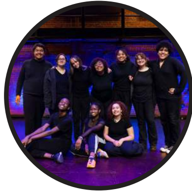
July 2023 The WYSH Project

Conservatory students rehearsed for a record setting 25 events resulting in 51 performances at 10 different venues throughout the year. These performance opportunities are a crucial part of the student experience and provide budding performers with the opportunity to put their year-round studio work to use on stage.