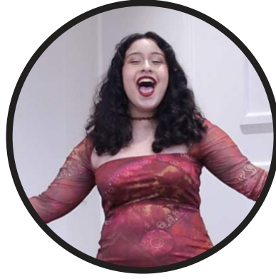
June 2024 Spring Voice Recitals