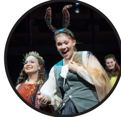
February 2024 A Midsummer Night's Dream