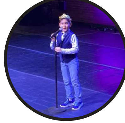
March 2024 Conservatory's Got Talent!