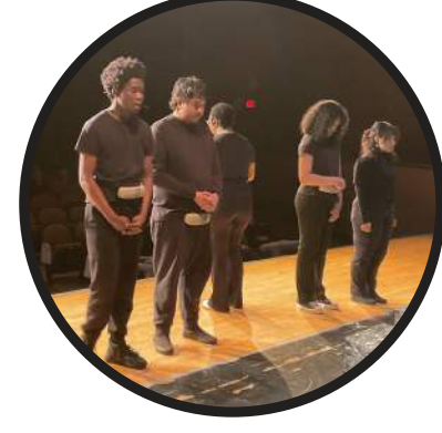
April 2024 WYSH 2024 Tour