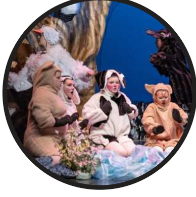
March 2024 The Stories of Hansel & Gretel and Peter & the Wolf