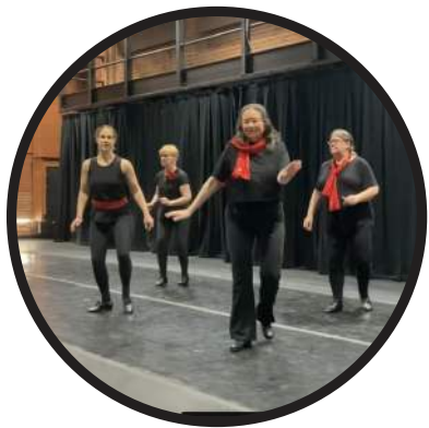
May 2024 Adult Acting & Dance Performance Showcase