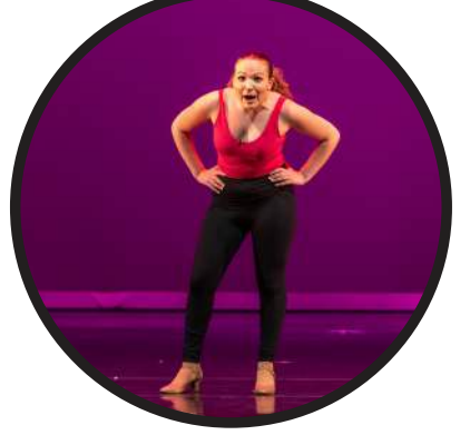
May 2024 Acting Performance Showcase