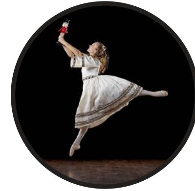
November 2023 The Nutcracker