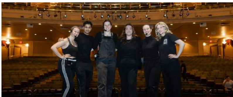
Front: Ballet student. Motel the Tailor from the Youth Summer Program's production of Fiddler on the Roof . Photos @UnityMike. Inside and back page: Photos courtesy of the conservatory.

34 local students took advantage of 41 internship and apprenticeship opportunities with our education department last season. These paid learning opportunities allow area students to work behind the scenes supporting the productions and programs we run throughout the year. Internships provide the next generation of designers, technicians, managers, and performers to get real-life experience in a thriving performing arts center.