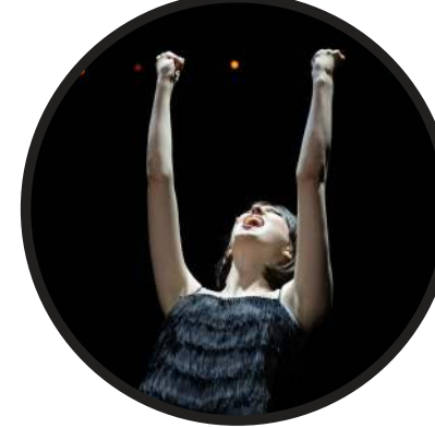
June 2024 Cabaret by the Youth Acting Company