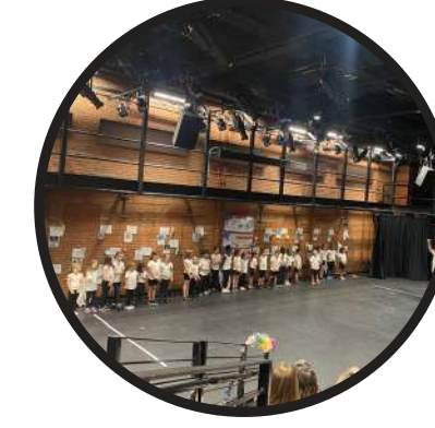
June 2024 Children's Youth Summer Program