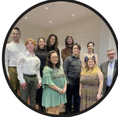
January 2024 Winter Voice Recital