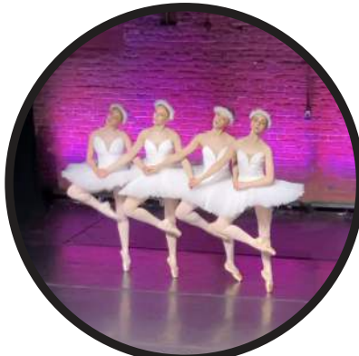
May 2024 Student Choreography & Variations Recital