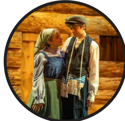
July & August 2023 Youth Summer Program Fiddler on the Roof