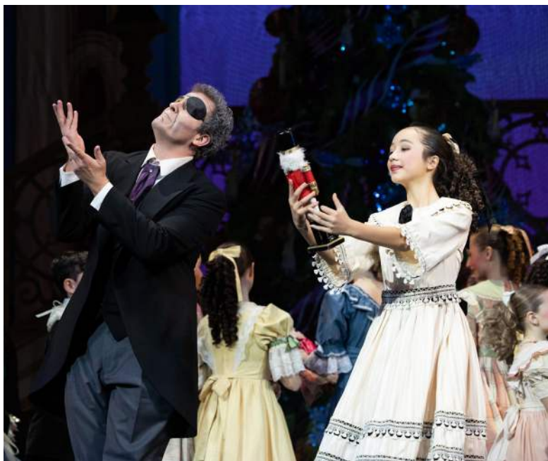
Exhibit This The Nutcracker Universal Ballet Competition Winter Voice Recital Youth America Grand Prix WYSH 2022 Tour The Seagull The Stories of Hansel & Gretel and Peter & the Wolf Youth America Grand Prix Finals Worcester County Dance Festival Student Choreography & Variations Recital Acting Performance & Comedy Lab Showcase Spring Reflection Spring Voice Recital Rock of Ages: Teen Edition Children's Youth Summer Program Showcase Fiddler on the Roof Fiddler on the Roof, Jr. The WYSH Project 2023

OUR MISSION: To ignite and nurture a passion for the performing arts in audiences and artists of today and tomorrow.