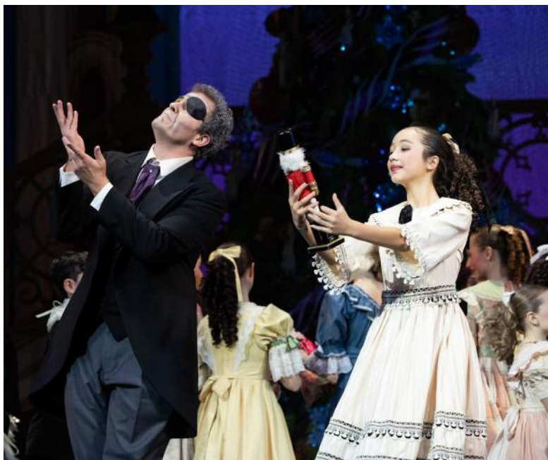
Exhibit This The Nutcracker Universal Ballet Competition Winter Voice Recital Youth America Grand Prix WYSH 2022 Tour The Seagull The Stories of Hansel & Gretel and Peter & the Wolf Youth America Grand Prix Finals Worcester County Dance Festival Student Choreography & Variations Recital Acting Performance & Comedy Lab Showcase Spring Reflection Spring Voice Recital Rock of Ages: Teen Edition Children's Youth Summer Program Showcase Fiddler on the Roof Fiddler on the Roof, Jr. The WYSH Project 2023

OUR MISSION: To ignite and nurture a passion for the performing arts in audiences and artists of today and tomorrow.